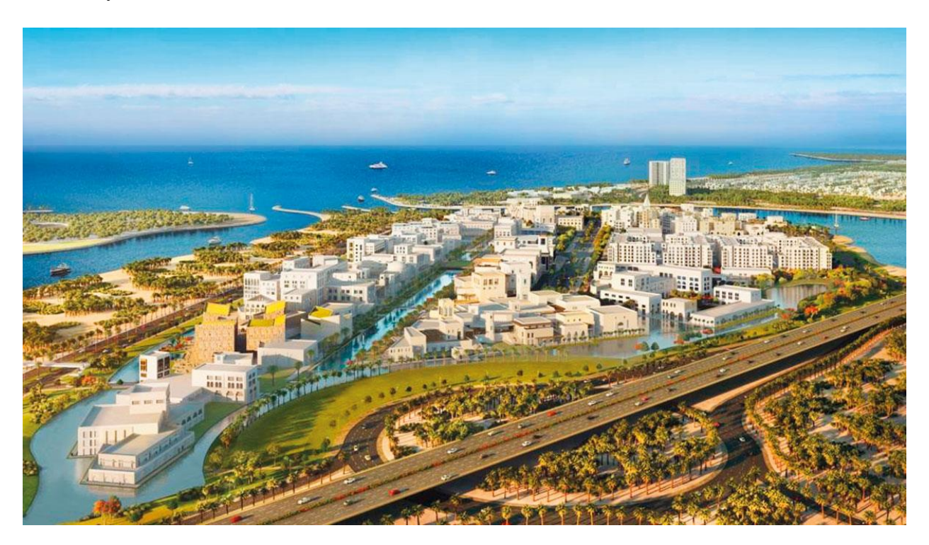
A view of the Dh2.4 billion mixed-use development Maryam Island in Sharjah.

Then there is the Al Zorah in Ajman, where Phase 1 works at the 5.4 million square metre development is nearly over. Phase 1 represents 15 per cent of the overall master plan, and the developer is finalising details for the soon-to-launch Phase 2, which will involve further raising the "appeal" of the destination through hotels and a beach club. The intention, according to a senior official, is to be an attraction not just for visitors from within the Northern Emirates but eventually from Dubai as well.